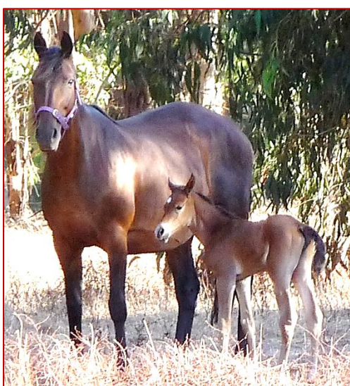
Galaxy (one day old) with her mother, Hoochie.

I bought a riding horse and rode in gymkhanas, competing in dressage, show Jumping, cross country jumping and polocrosse.