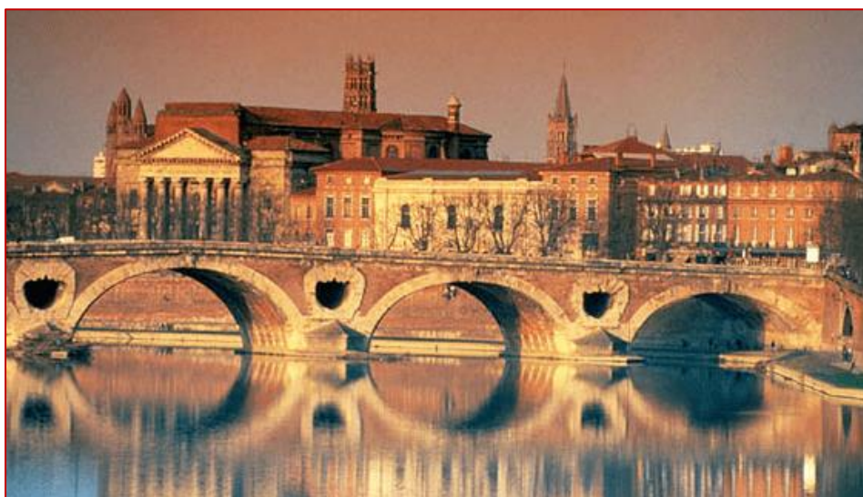
Toulouse University France.